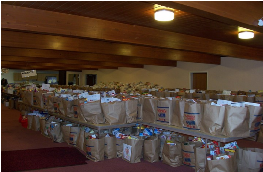
2012 program. Over 20,000 items needed for 2013.

It is time for the community wide Thanksgiving Food Collection which plans to serve 450 families this year. This event is a partnering between EFPN, Aldersgate Methodist Church and the Department of Human Services. Canned and packaged foods and personal care items will be collected at Aldersgate